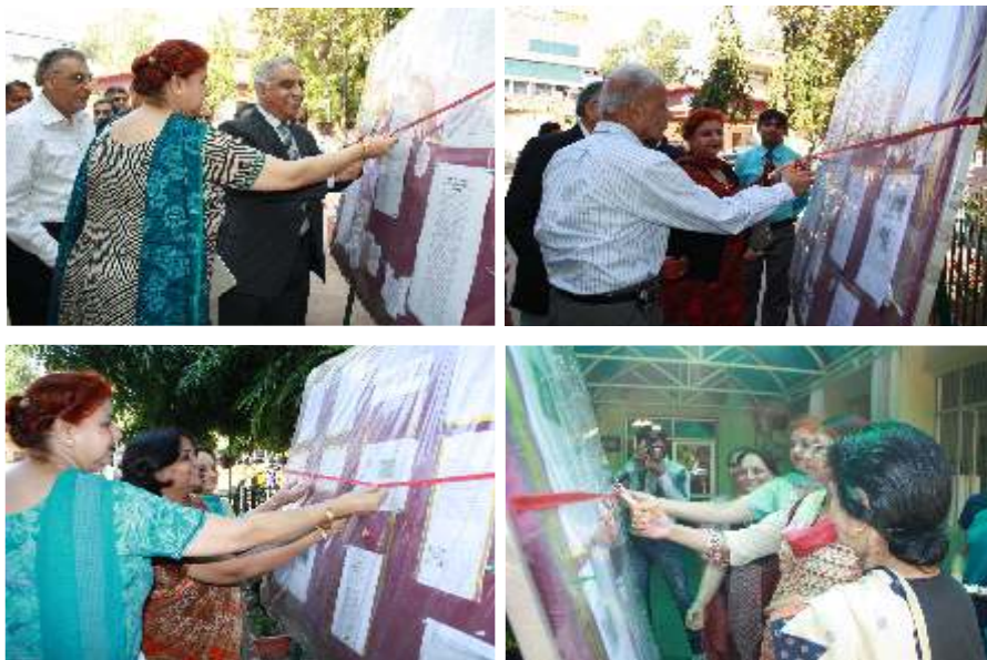
Different issues of the Wall Magazine being released by dignitaries

The Wall magazine is a regular and significant feature of the centre. The purpose is to highlight the news clippings and achievements of women which otherwise go unnoticed by the student community. Ten issues of wall magazine were displayed during the current session such as "Human Rights and Women", "Social Taboos", "Disability", "Crime against women" etc. to sensitise young teacher trainees.