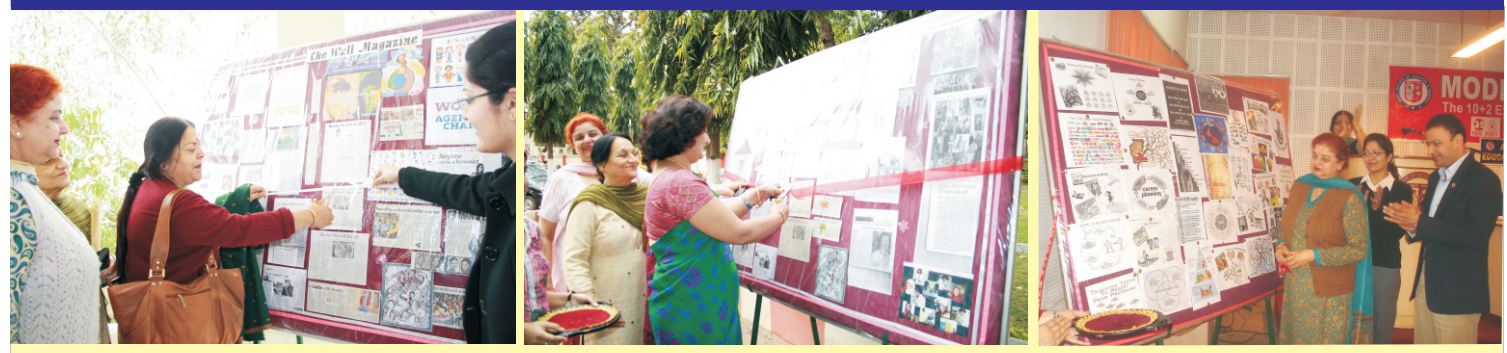
Different issues of the Wall Magazine being released by dignitaries.