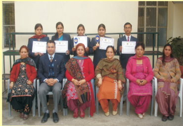
Winners of Debate Competition on the topic "Save Fuel Yanni Save Money" organized by R.M.College of Education.