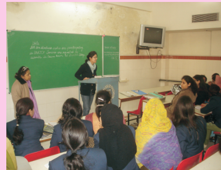
A Group Counselling session in progress