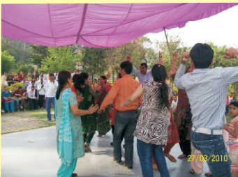
Students enjoying themselves at the college picnic