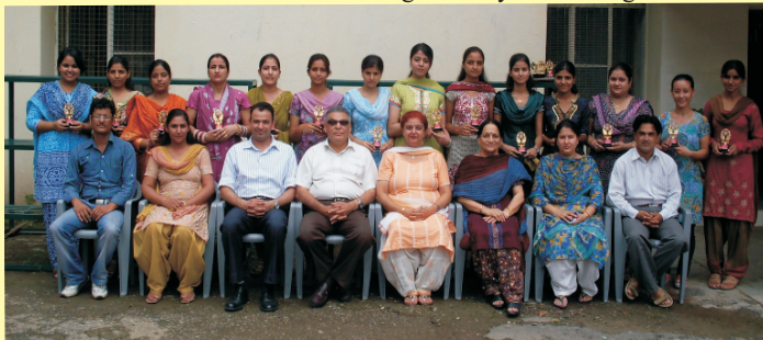
Winners of Singing Competition posing for picture with their trophies.