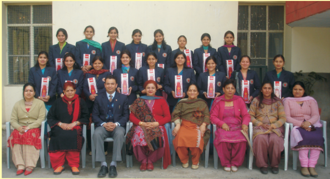
Group of students who participated in Gidda Competition organised by the Dept. of Youth Services & Sports, J&K on the eve of Republic Day with their prizes.