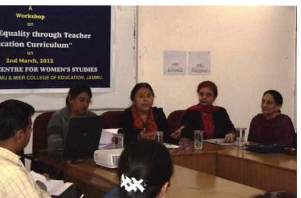
A one day workshop on Gender Equality organised by the centre in collaboration with CWS, University of Jammu.