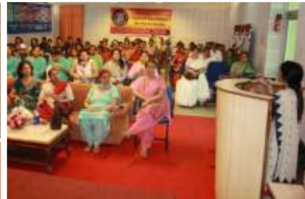
A patriotic group song programme was organized by Viraj Kala Kendra on the eve of Independence Day.