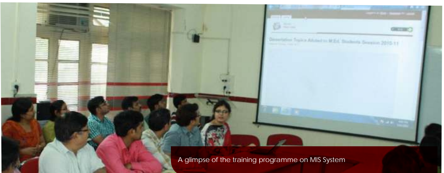
A glimpse of the training programme on MIS System