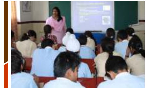
Adolescent Education Programme in progress