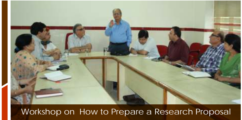
Workshop on How to Prepare a Research Proposal