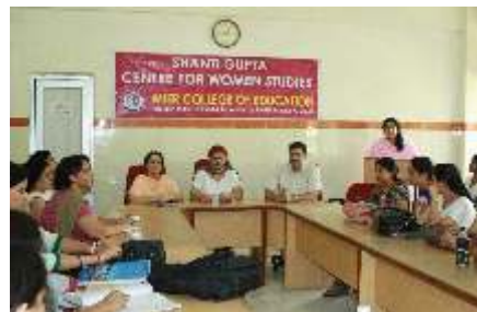
A view of the symposium organised on Women's Equality Day.