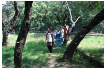
To celebrate World Wildlife Week and to create awareness about the preservation of wildlife a visit to Wildlife Sanctuary at Manda was organised on 9th Oct.,2011.