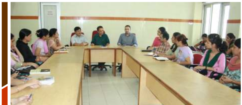
Lecture on Teacher Education Scenario in the the State