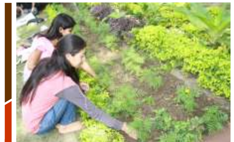
To celebrate Earth Day on 20th April, 2012, a cleanliness drive was organized. The students cleaned the gardens of the campus and removed the non-biodegradable garbage and weeds.

World Ecology Day was celebrated by organising a visit to Sher-E-Kashmir University of Agricultural Sciences and Technology (SKAUST) Chatha, Jammu on 1st November, 2011. The students were taken a round to the composting plant and acquainted with the