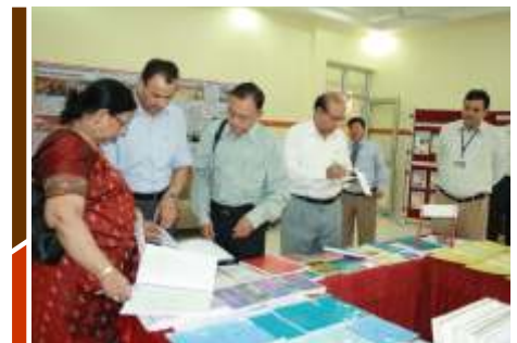
Members of NAAC Peer Team visiting the college