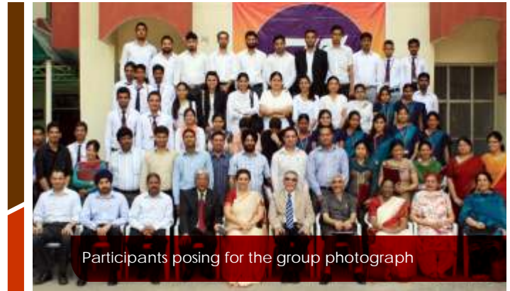
Participants posing for the group photograph