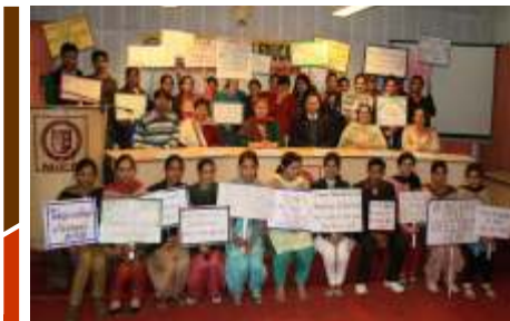
Energy Conservation Day was celebrated on 14th Dec.,2011. Students made slogans on the conservation of energy resources.

campaign, a group of 35 students visited the sacred grooves. The objective was to bring students close to nature and witness the seamless blend of nature and tradition. They also visited the pond and temple around the area. Botanical Garden: Saplings were planted at MIET to create a botanical garden as a hands on experience for the students to explore the plant world. Inter College Symposium: An Inter College Symposium was organized on the theme 'Challenges of Sustaining Forests in an Ever-changing Ecosystem'. Dr. C.M Seth, Chairperson, WWF was the Chief Guest. Ten students from various Colleges of Education across Jammu city participated in this symposium.