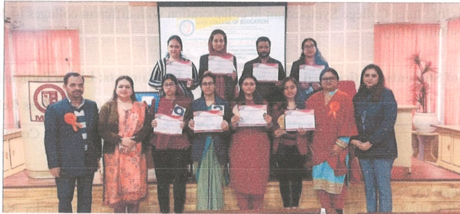
Participants and achievers with trophies and certificates