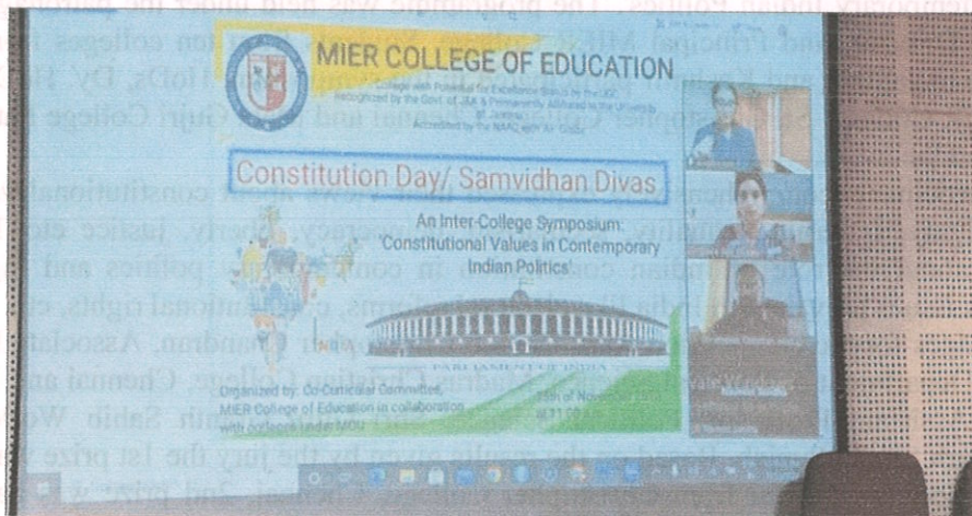
E-Banner along with the online presence of Judges and participants