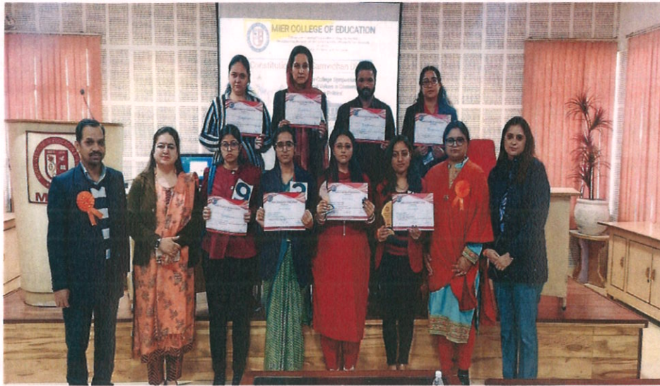
Group photograph of participants with Judges, Convener and participants.