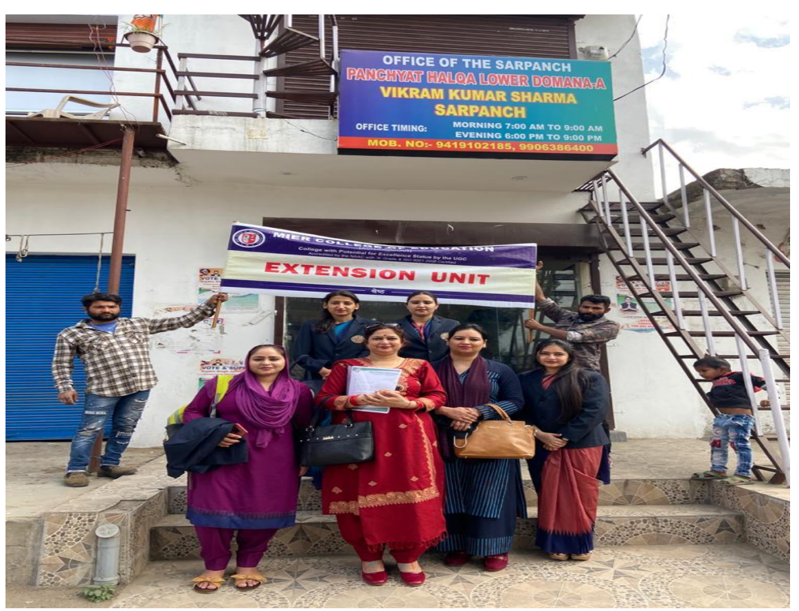
Meeting with Sarpanch for adopting village