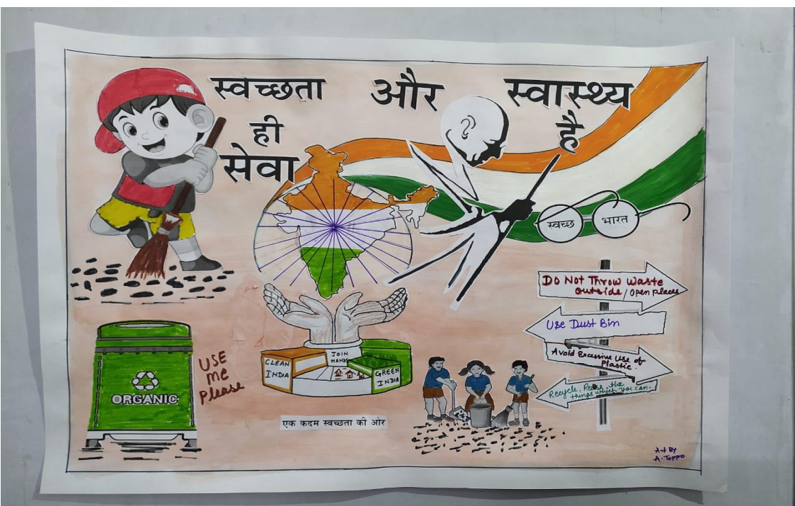
Students Participating in Swachchta Abhiyan