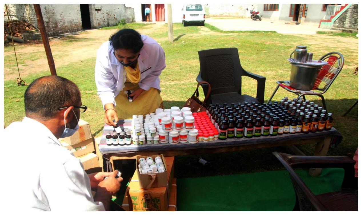
Medical Camp at Domana village