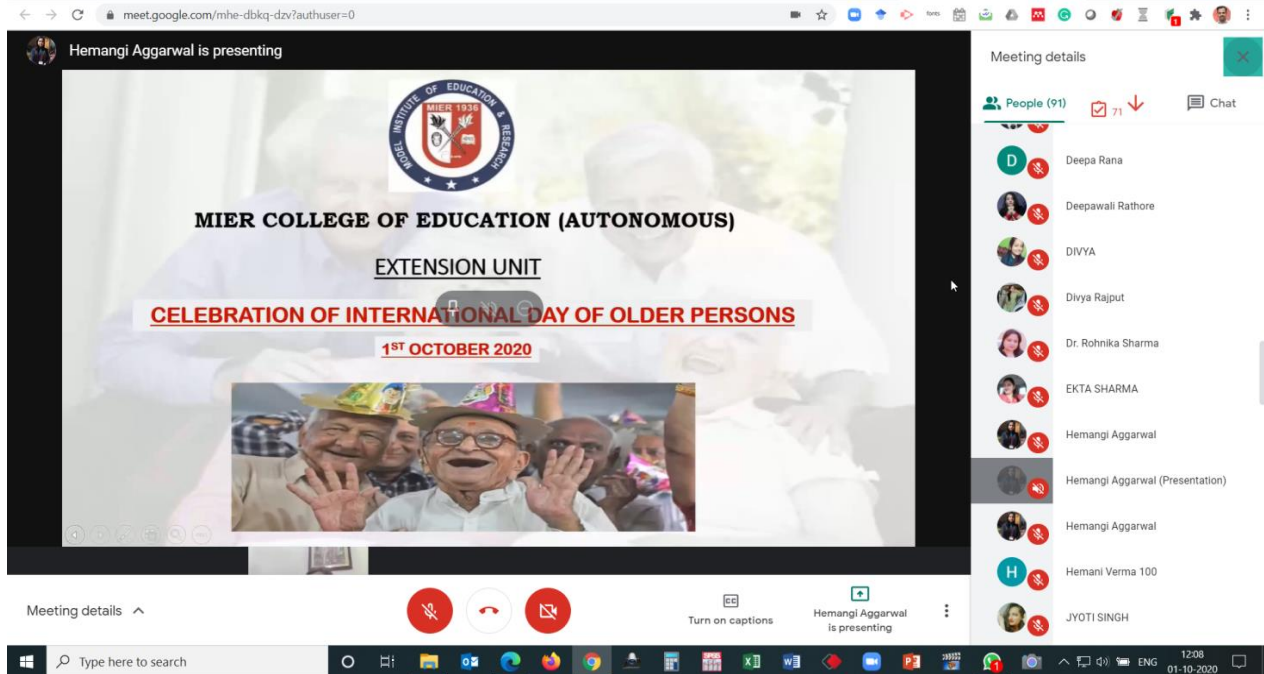
Online Celebration of International Day for Older Persons- 1/10/2020