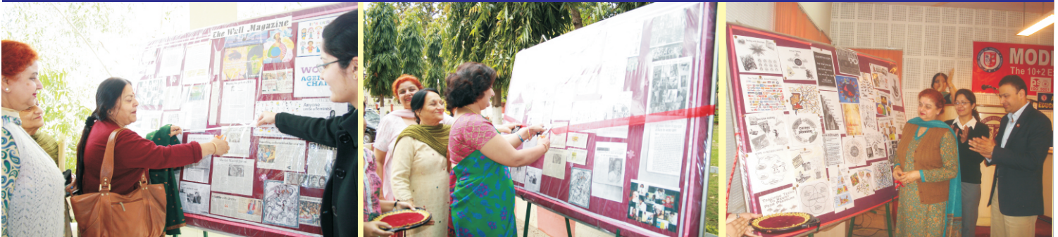
Different issues of the Wall Magazine being released by dignitaries.